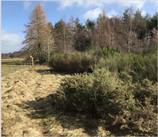
GRASSY SCRUB AREA