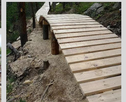
Safe pump tracks for kids