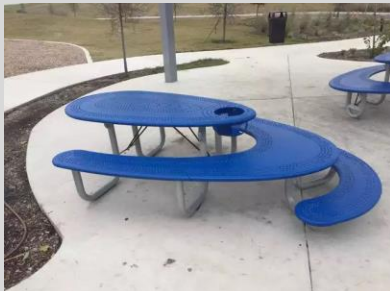
Wheelchair and infant friendly benches (in wood, not plastic)