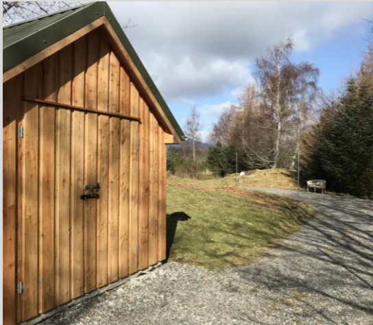
SHED SIDE OF CENTRE